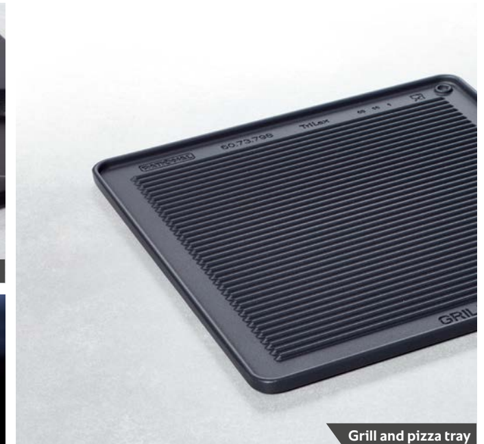
Grill and pizza tray