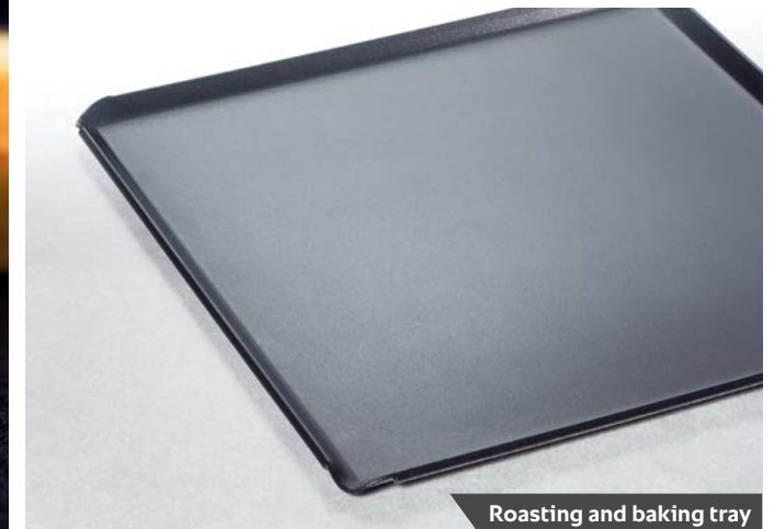
Roasting and baking tray

For more information, please request our Accessories brochure or our application manuals, or visit our website at rationalusa.com .