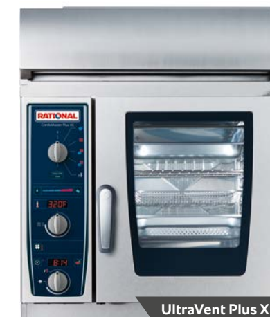
UltraVent Plus XS