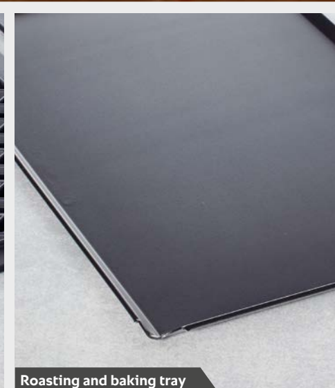
Roasting and baking tray