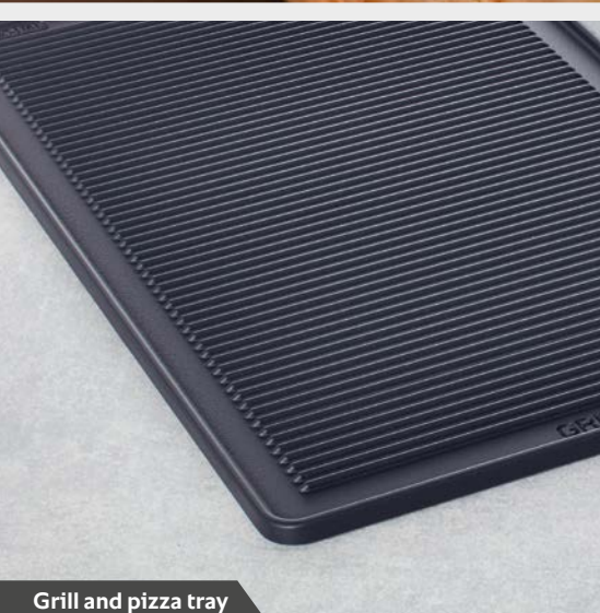
Grill and pizza tray

For more information, please request our Accessories brochure or our application manuals, or visit our website at rationalusa.com .