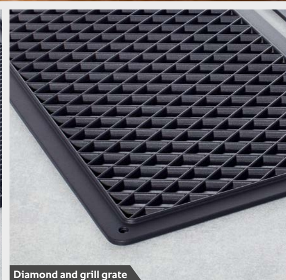
Diamond and grill grate